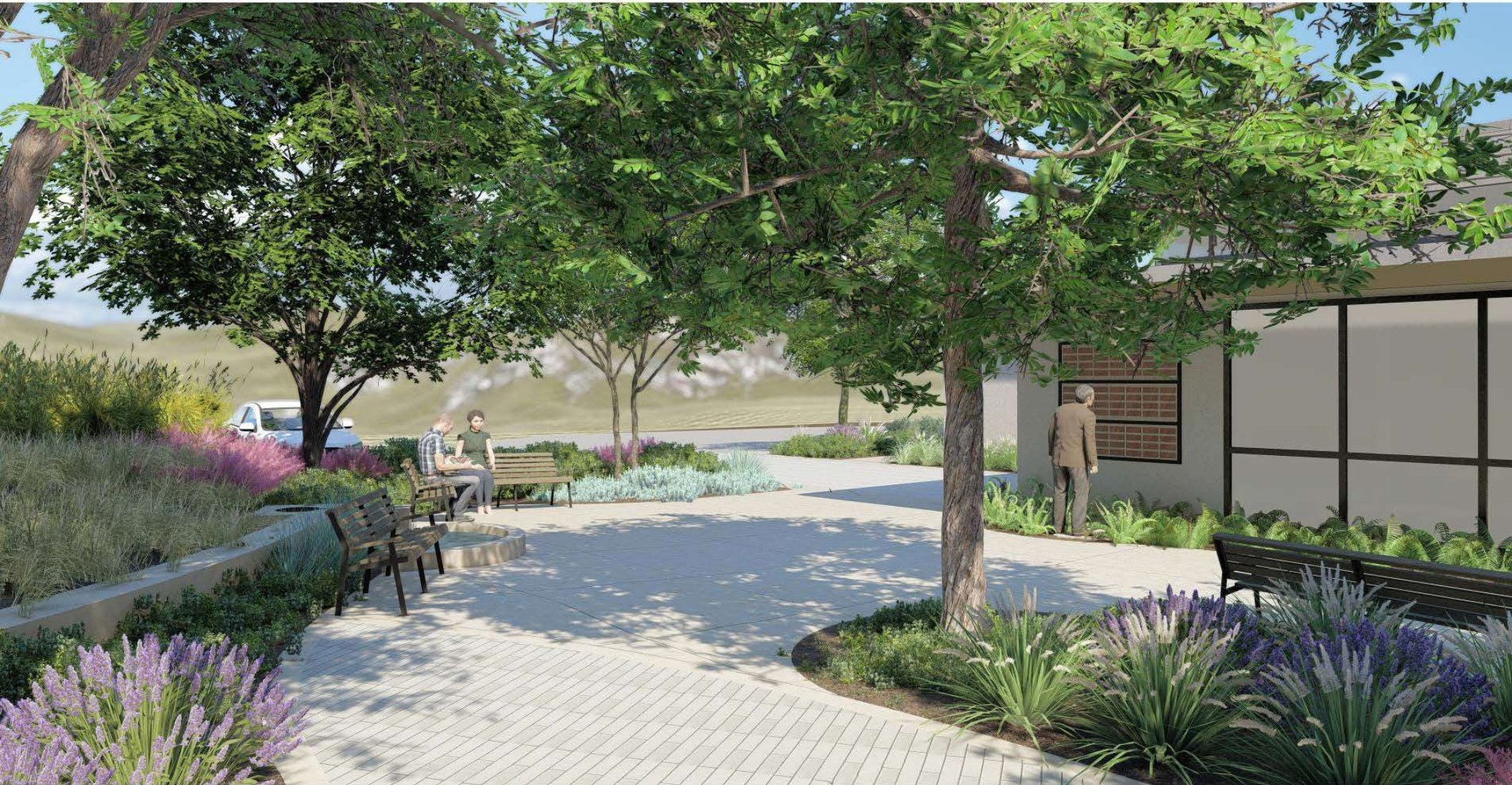
MEMORIAL COURTYARD | UU MARIN PLAZA