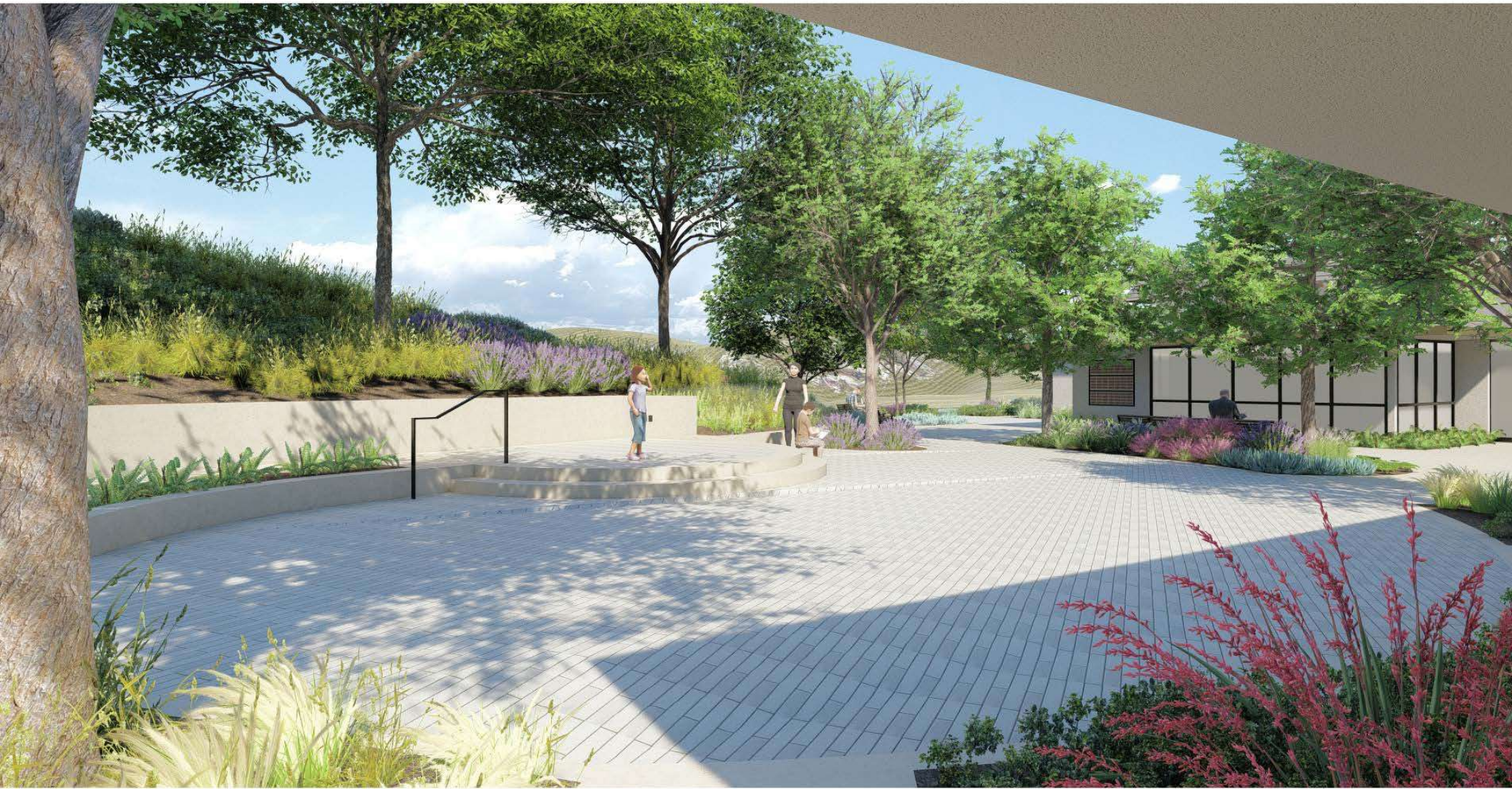
EVENT SPACE + ACCESSIBLE RAMP | UU MARIN PLAZA