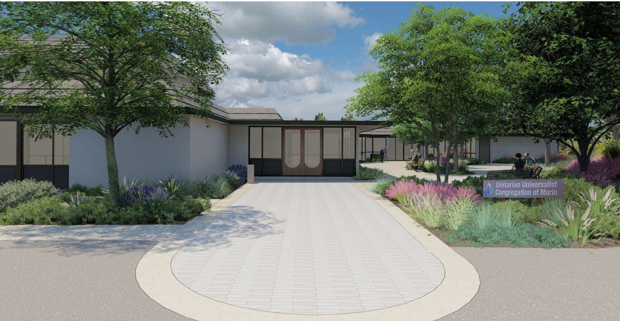
ENTRY WALK | UU MARIN PLAZA