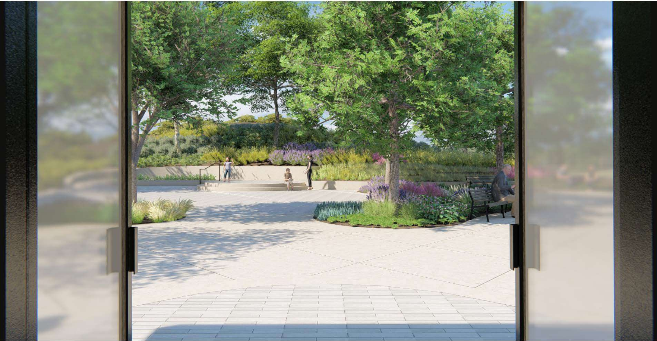
GALLERY ENTRY | UU MARIN PLAZA