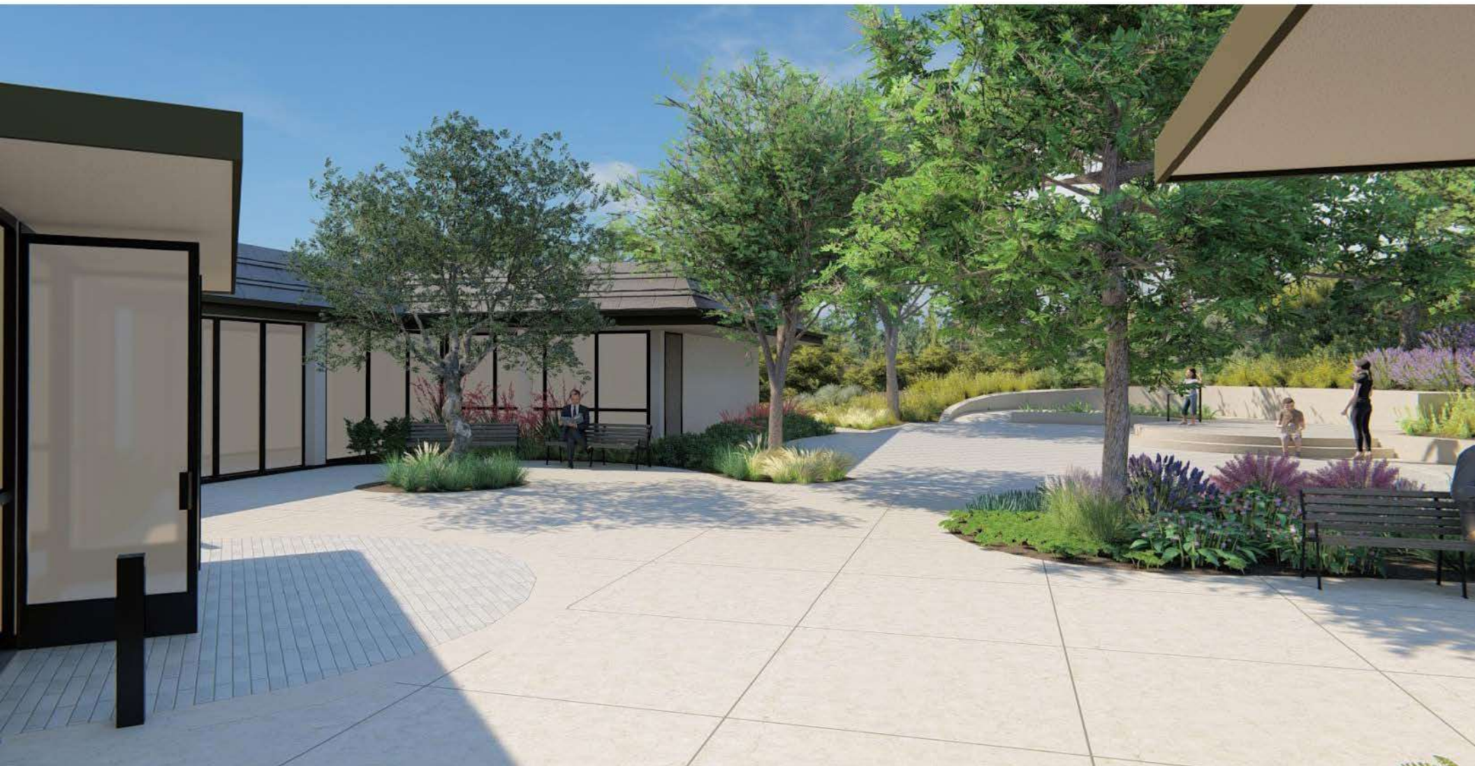
GALLERY PLAZA | UU MARIN PLAZA